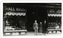
Exterior view of Wall Bros. Shoe Store, 94-96 Queen St. W., Toronto, 1943.