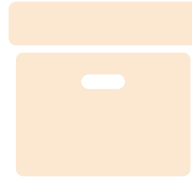
Apartment building on Beverley Street, 1924.