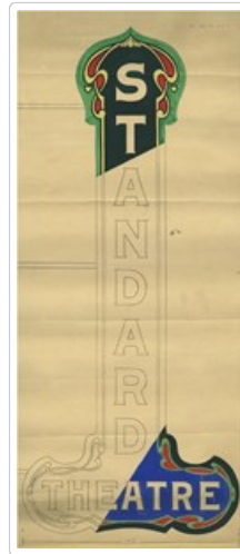
Designs for the Standard Theatre, 1921-1922.