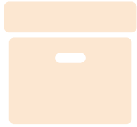
Apartment building on Beverley Street, 1924.